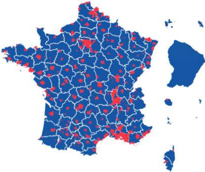
■ Zone d'initiative privée ■ Zone d'initiative publique