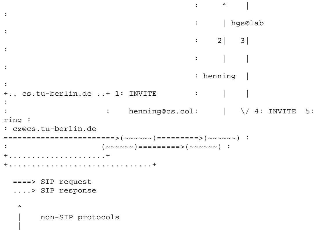
Figure 1: Example of SIP proxy server

The redirect server shown in Fig. 2 accepts the INVITE request (step 1), contacts the location service as before (steps 2 and 3) and, instead of contacting the newly found address itself, returns the address to the caller (step 4), which is then acknowledged via an ACK